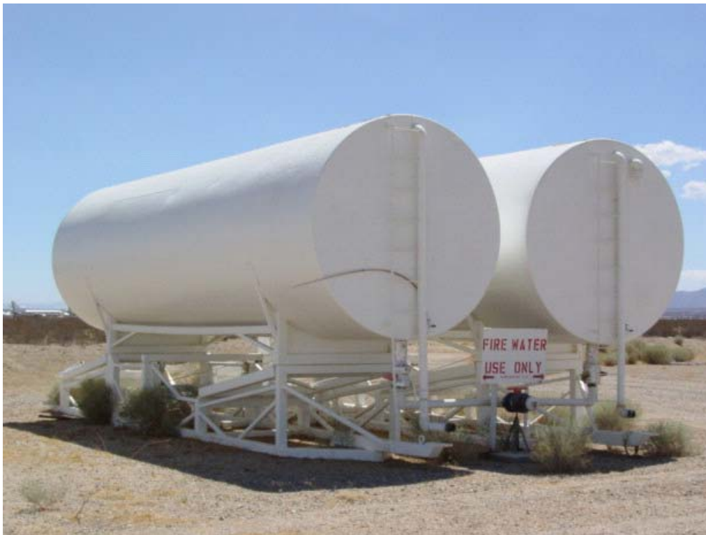
Figure 17. Bulk Water Storage