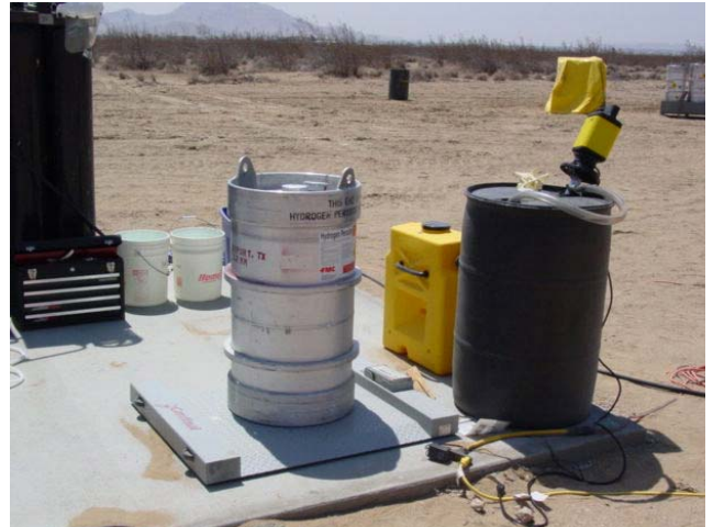
Figure 11. HTP Drum with Drum Scale and Transfer Equipment