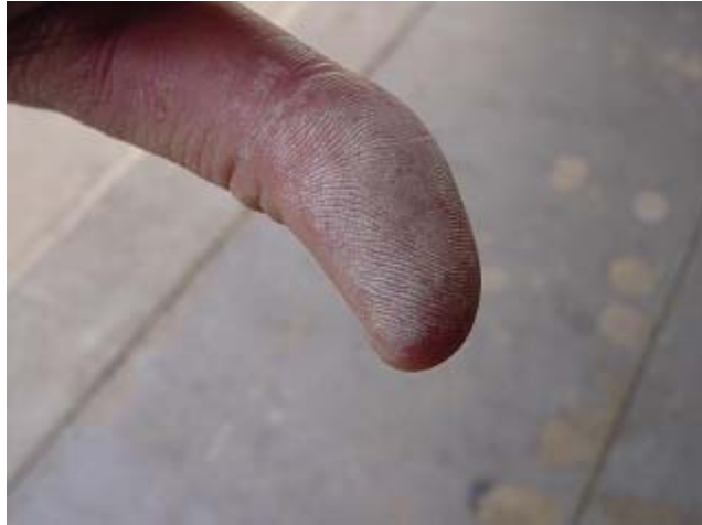
Figure 6. Skin Bleached by HTP