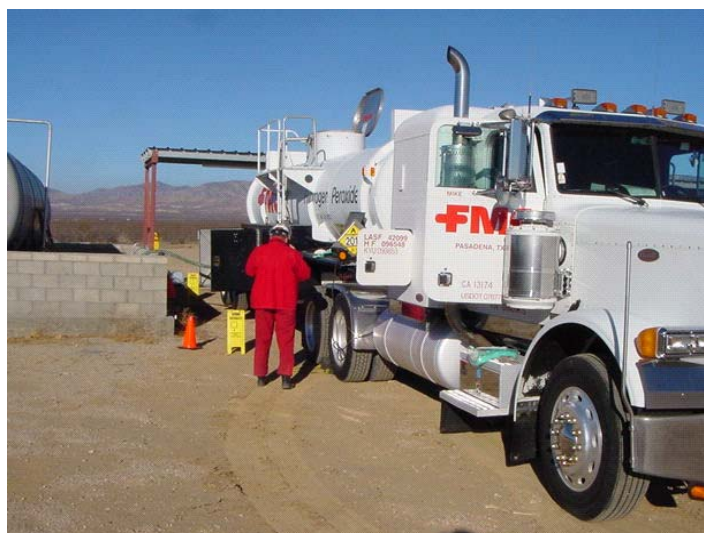
Figure 15. HTP Tanker Truck Transfers HTP to Bulk Tank