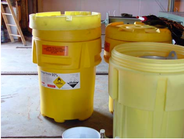
Figure 10. HTP Drum Overpacks