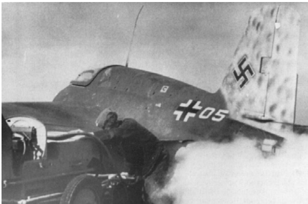
Figure 1. ME163 Rocket Plane Propellant Transfer Operations