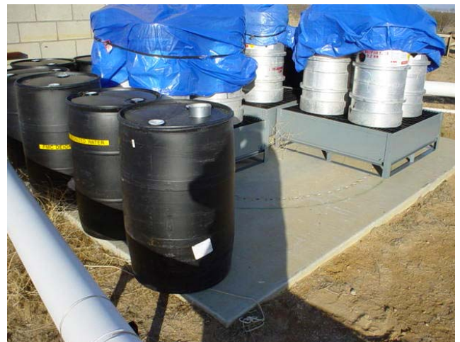
Figure 9. Drums of HTP with De-ionized Water Drums