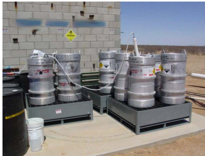
Figure 12. Aluminum Drums with Transfer Hose and Dip Tube