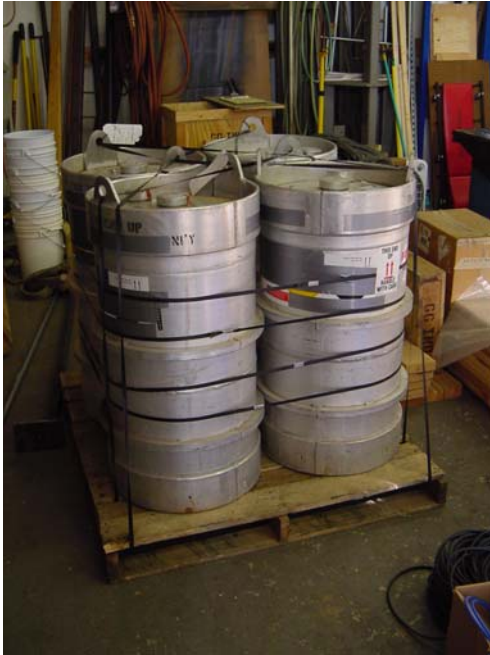
Figure 13. Aluminum Drums Rinsed and Ready for Return Shipment