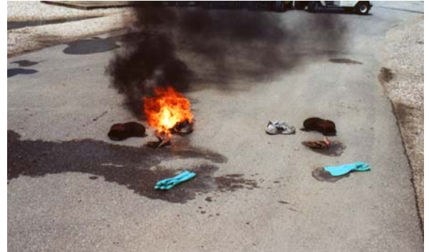
Figure 7. Fire Caused by Auto-ignition of a Shoe with HTP