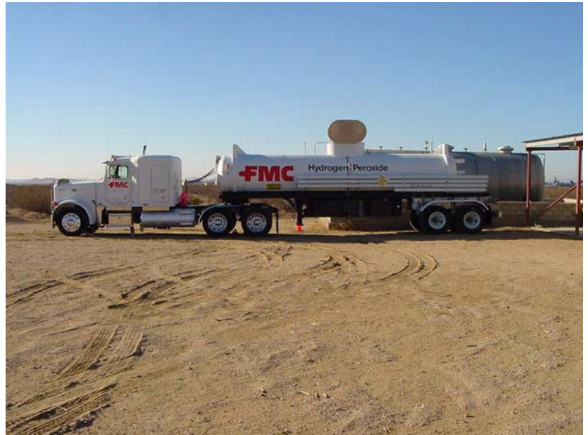
Figure 14. HTP Tanker Truck and Bulk Storage Tank