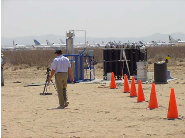
Figure 3. Typical Remote Operations with HTP