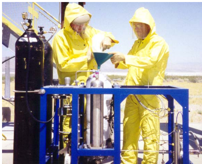
Figure 5. Personnel Protection Equipment - PVC