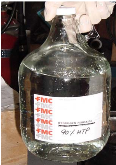
Figure 8. Lab-Scale One Gallon Jug of HTP